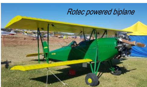
Rotec powered biplane