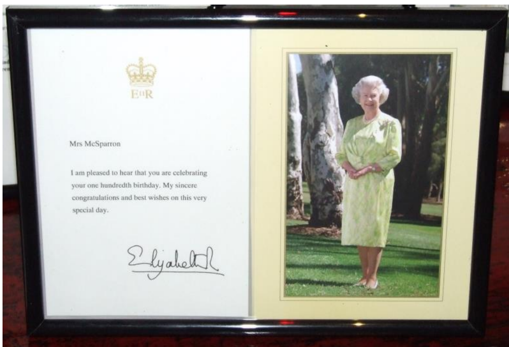
The message of congratulations from Her Majesty the Queen