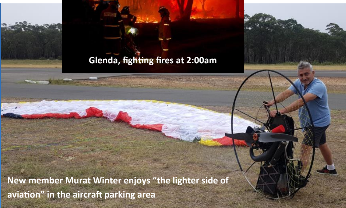
New member Murat Winter enjoys "the lighter side of aviation" in the aircraft parking area