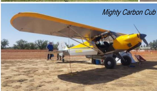
Mighty Carbon Cub