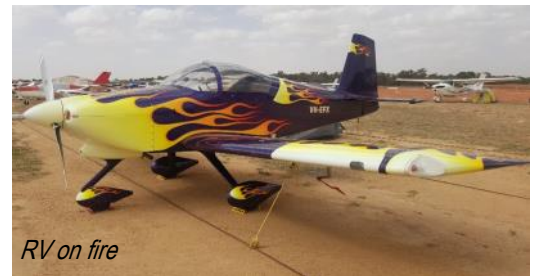
RV on fire