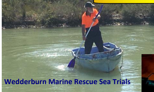
Wedderburn Marine Rescue Sea Trials