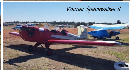
Warner Spacewalker II