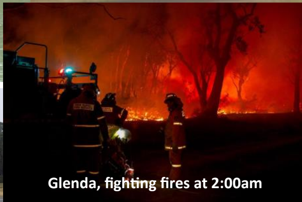
Glenda, fighting fires at 2:00am