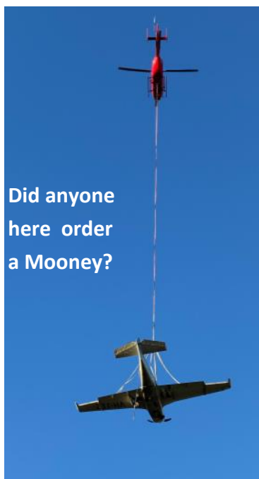
Did anyone here order a Mooney?