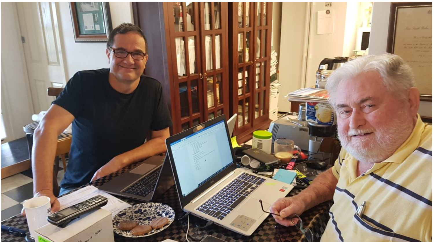
Club President and Secretary, recently captured whilst plotting to take over the world...