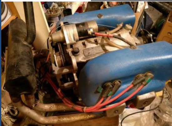
←← Jabiru 1.6 engine with propeller. Approx. 500h TT. $1500