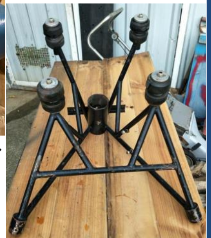
Jabiru engine mount to suit X-Air $300→→

All Located at Wedderburn-Sydney. Contact: Michael 0414 089 280