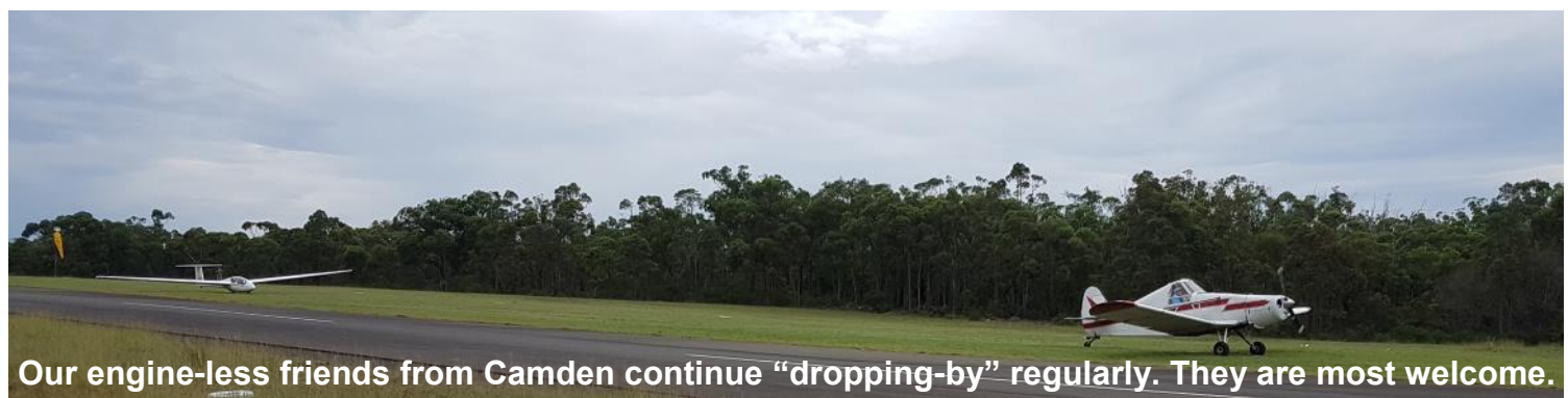
Our engine-less friends from Camden continue “dropping-by” regularly. They are most welcome.