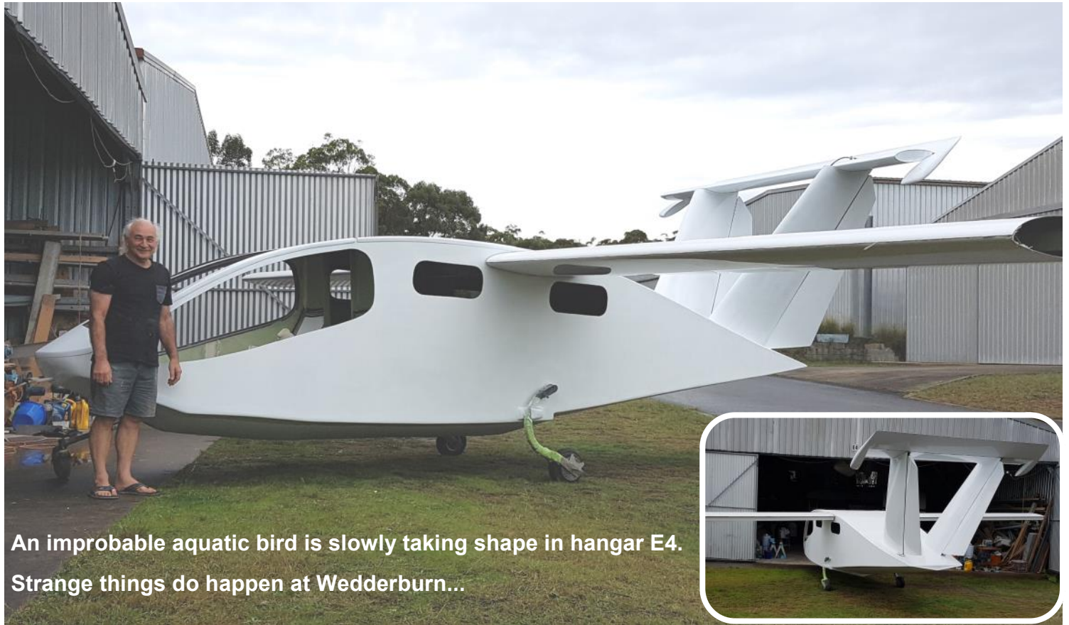
An improbable aquatic bird is slowly taking shape in hangar E4. Strange things do happen at Wedderburn...